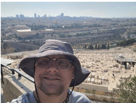
Temple Mound from the Mount of Olives